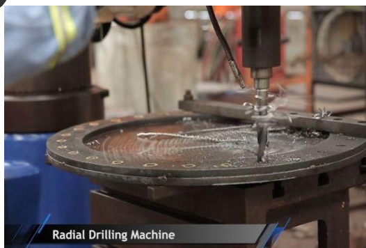
Radial Drilling Machine