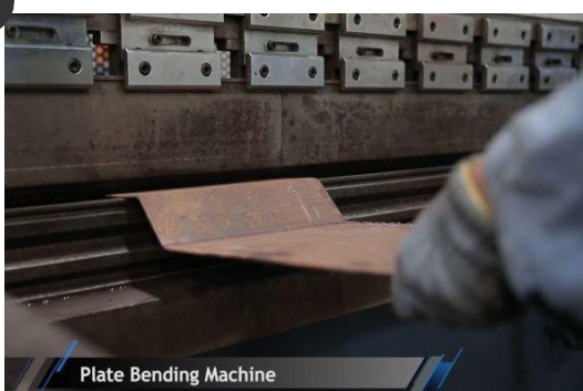
Plate Bending Machine