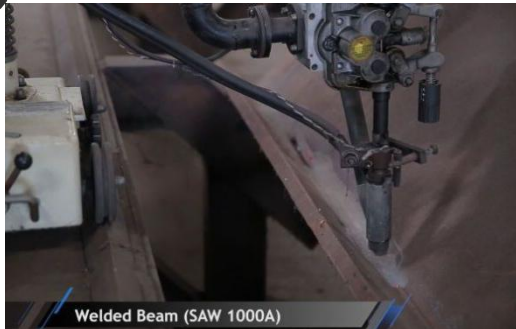
Welded Beam (SAW 1000A)