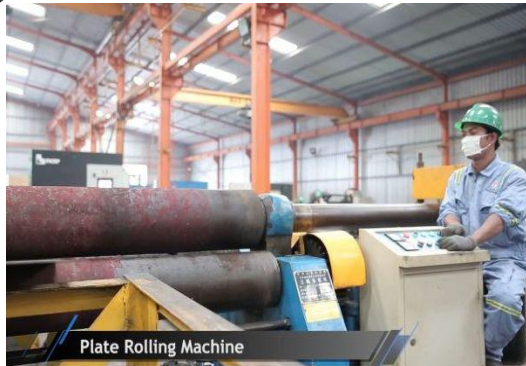
Plate Rolling Machine